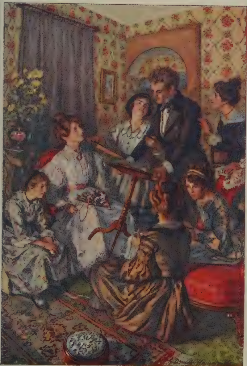
THEY WERE ENTIRE MISTRESSES OF THE PLACE